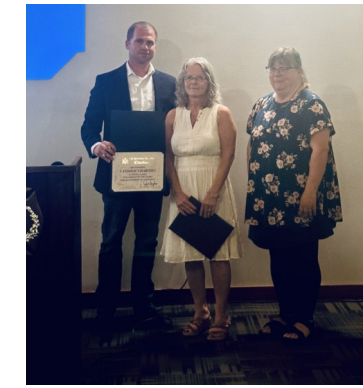
On June 5, 2025 Catholic Charities Delaware Otsego Schoharie was recognized as Non Profit of the year by the Sidney Chamber of Commerce.