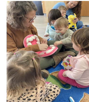
The Child Care Team has been visiting classrooms and home programs to talk with children about their teeth. Through funds from The Community Foundation Grant they were able to purchase tooth brushing kits for all children in the programs that they visited!