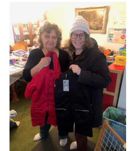
Through funds from The Community Foundation Grant, our Child Care Services Program was able to purchase winter outdoor gear for child care programs to use and have for children/families when needed.